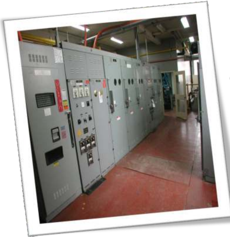
LT Panel (Universal Trade Tower)