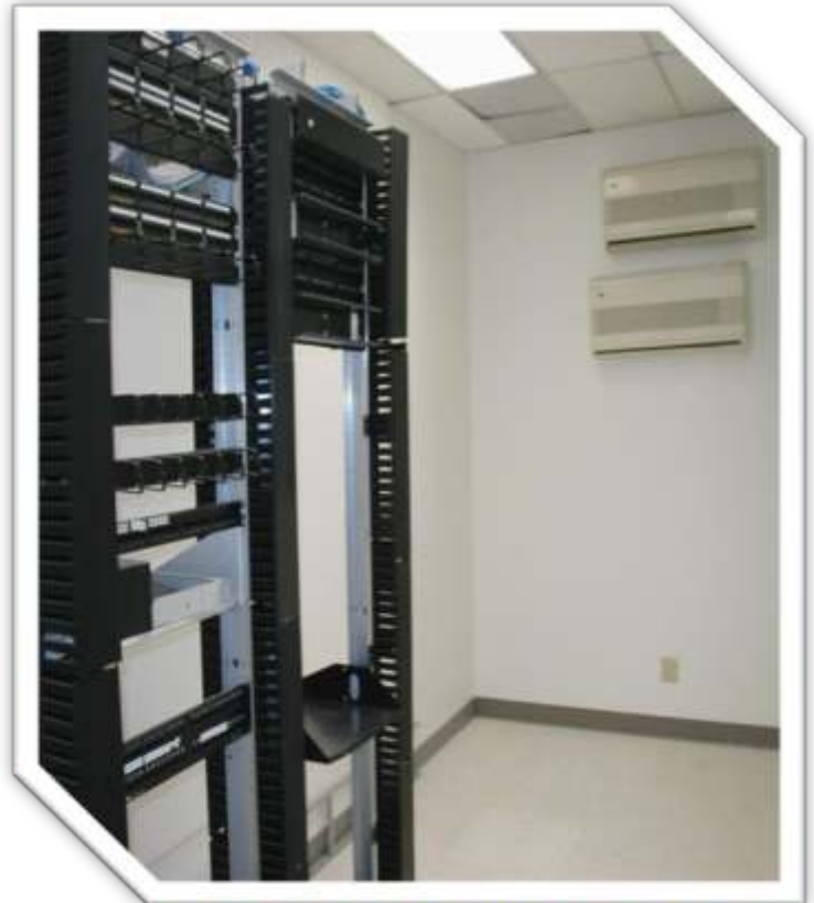
Server Rack (Emergent Venture India Ltd.)