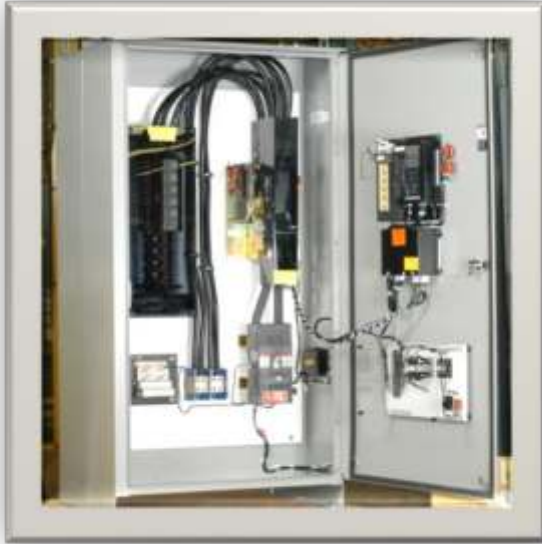
Control Panel (Orris Group)