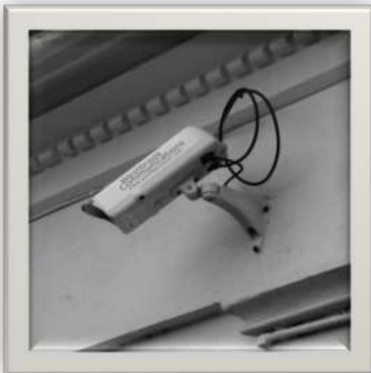
CCTV Camera (Infinity e Services)