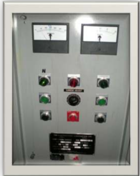
AVR Panel (Universal Group)