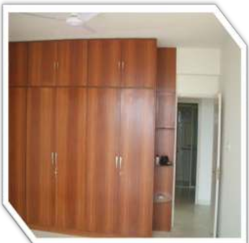
DLF Pinnacle, Gurgaon